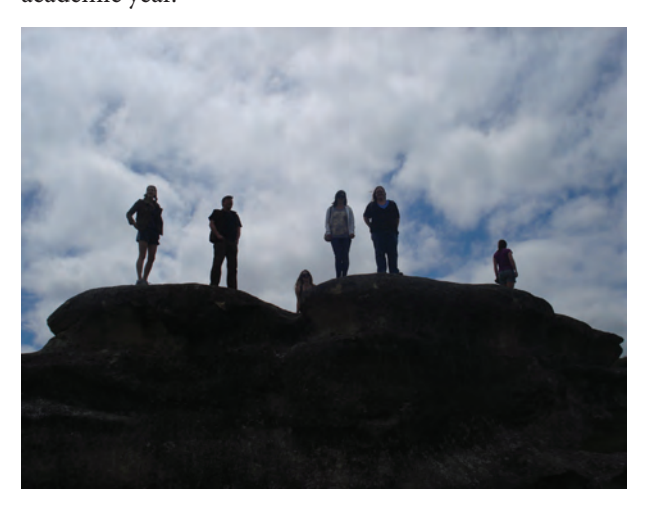
Happy holidays everyone!

To celebrate the end of semester and say goodbye to the Honours students, the entire lab bundled into a van in the middle of November to road trip & picnic at Elephant Rocks followed by fossil hunting in Duntroon We even saw some sunshine and had an absolutely brilliant day! What a way to celebrate the end of the academic year.