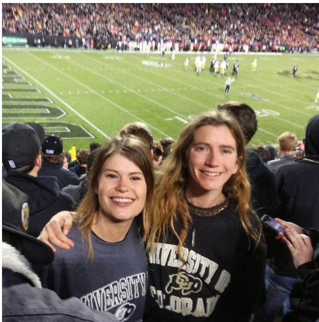
Colorado Buffs game