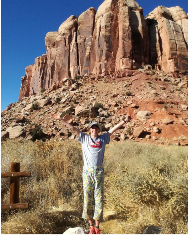
Rock climbing in Utah