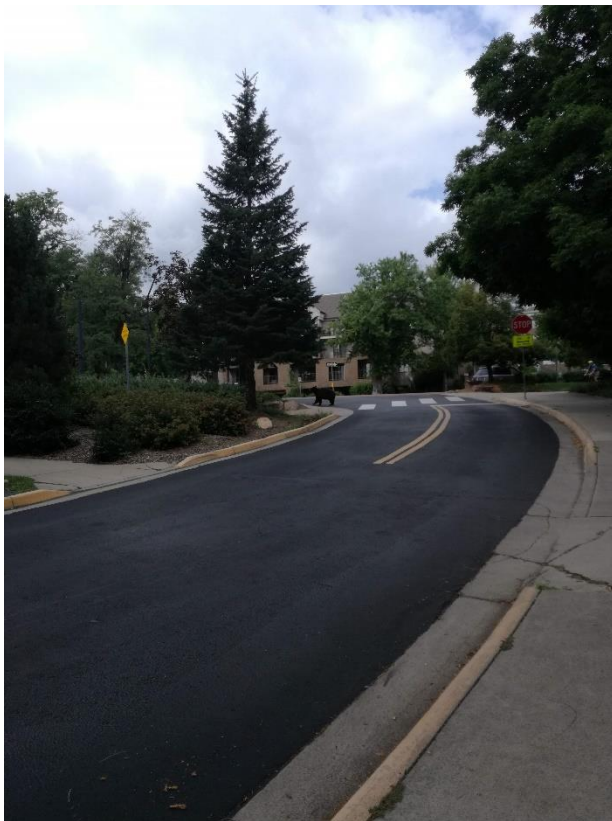
A bear on the university campus in my first week there