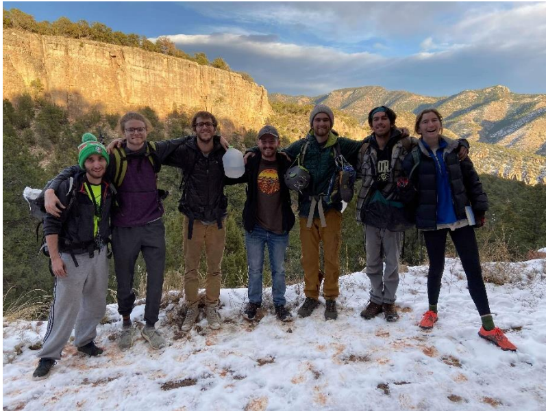
Rock climbing in Colorado