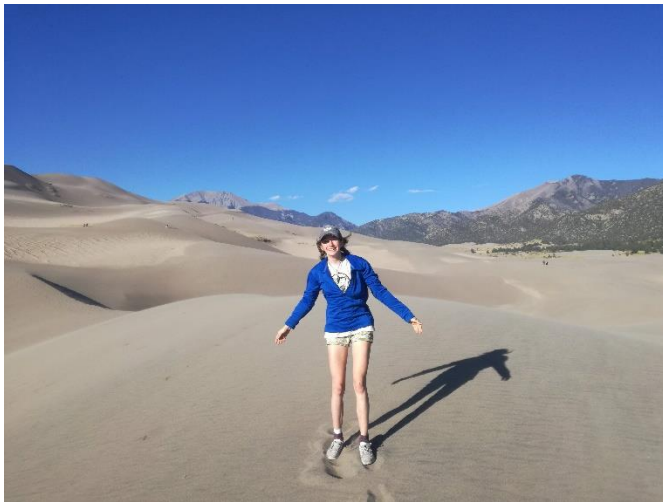
Largest inland sand dunes in North America