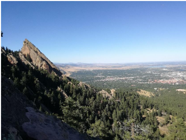
One of the local hikes in the area to the flatirons.