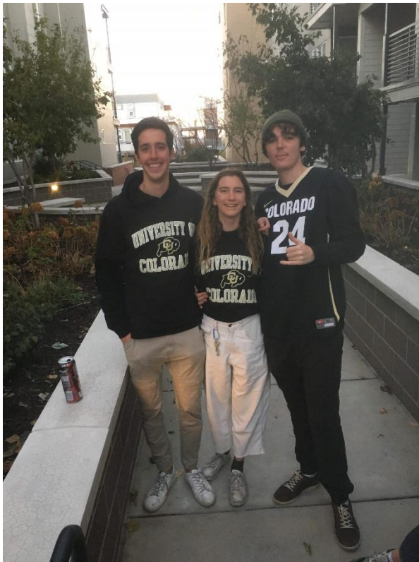
Buffs game with my flatmates