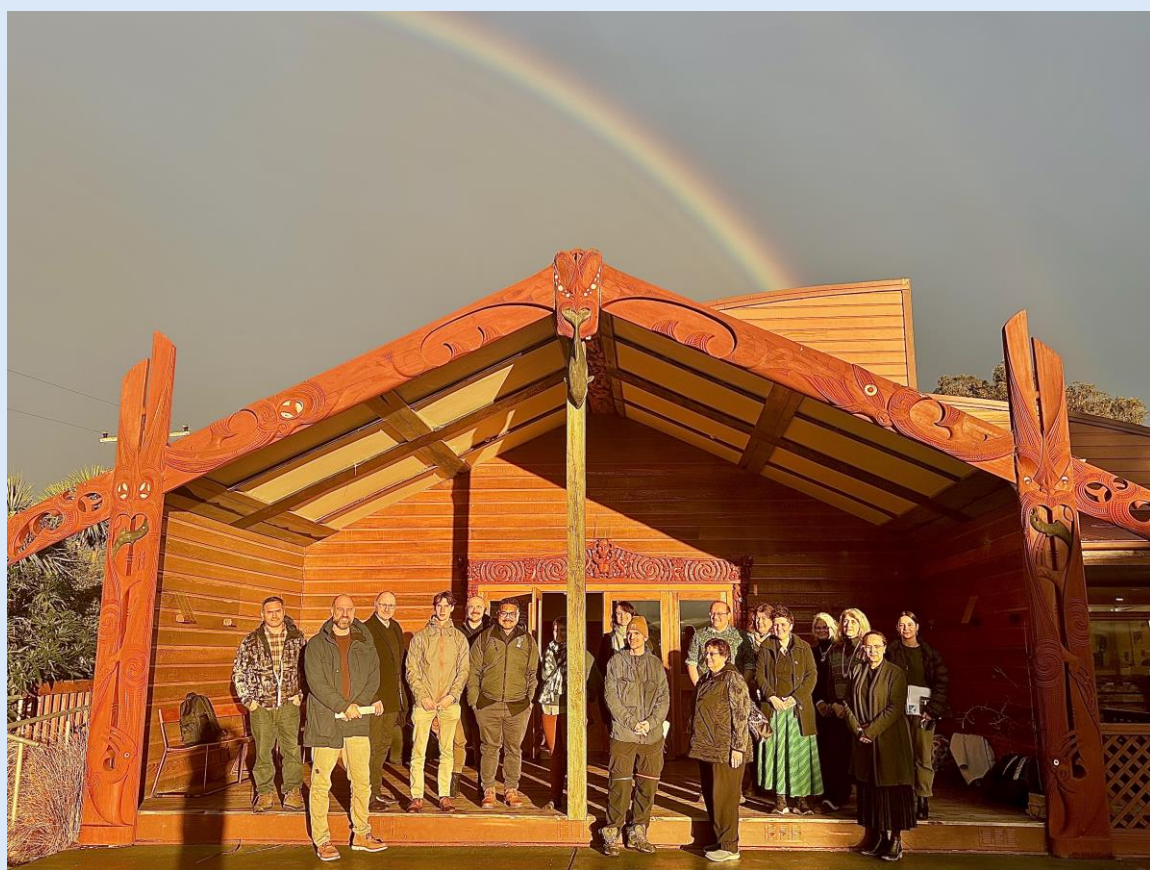
Te Maea Wānanga attendees standing outside Puketeraki Marae with a beautiful rainbow above

There are also upcoming opportunities for funding. He Ara Whakahiohiko Capability Funding applications are open from 20 August to 12 noon on 1 October 2025.