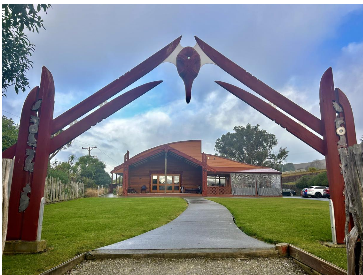
Puketeraki Marae - potentially a home base for future Te Maea hui