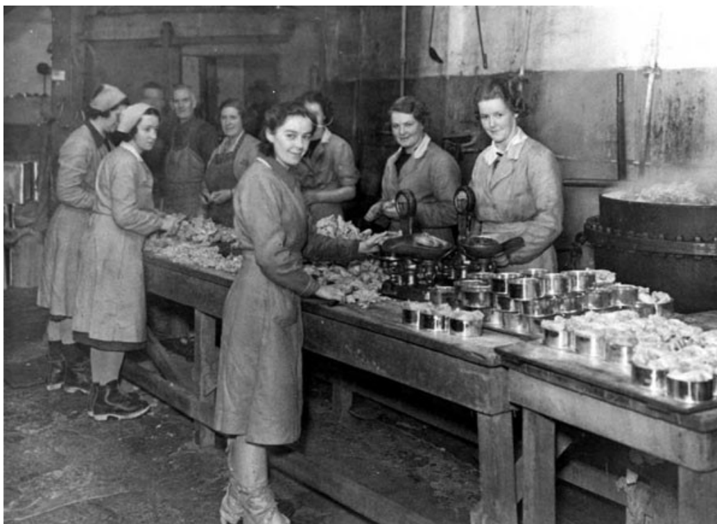
Packing sheep's tongues at Irvine and Stevenson St George Co. Ltd, 1942. S06-194b, Pictorial Collections.

Hocken Collections/Te Uare Taoka o Hākena 90 Anzac Ave, PO Box 56, Dunedin 9054 Phone 03 479 8868 reference.hocken@otago.ac.nz https://www.otago.ac.nz/library/hocken/