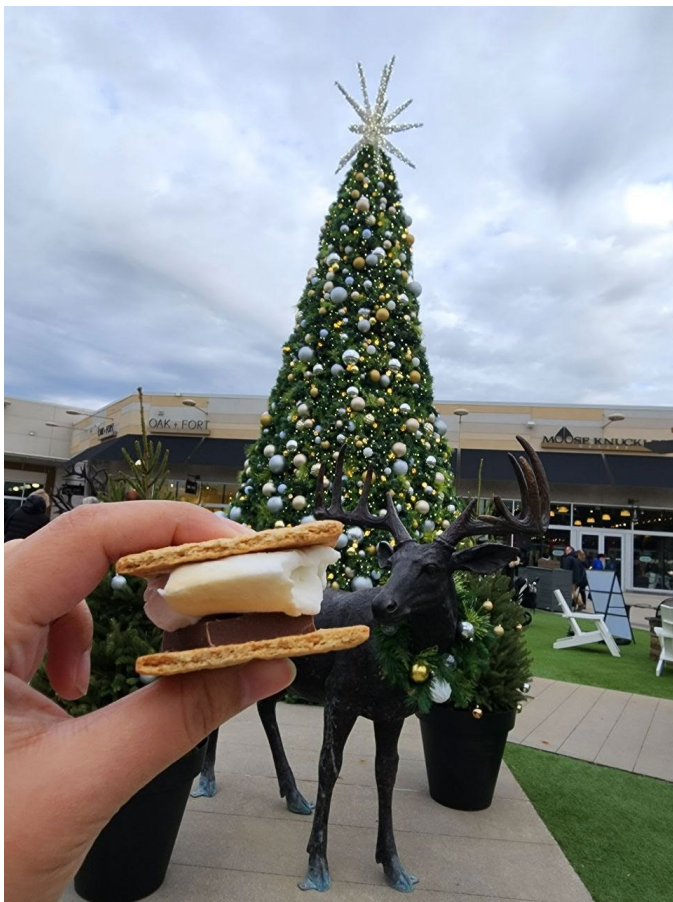
Figure 5 - Enjoying free S'Mores at Niagara Outlet Factory in December