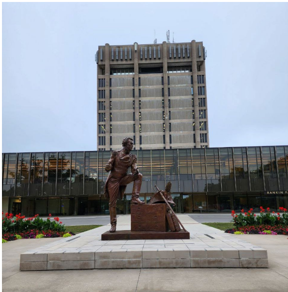
Figure 1- Statue of Sir General Isaac