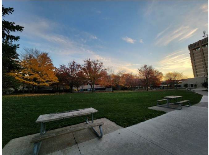
Figure 4 - Autumn vibes around Campus