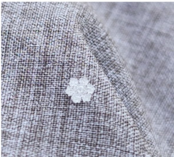
Figure 8 - Snow flake catching during one of the few light flurries