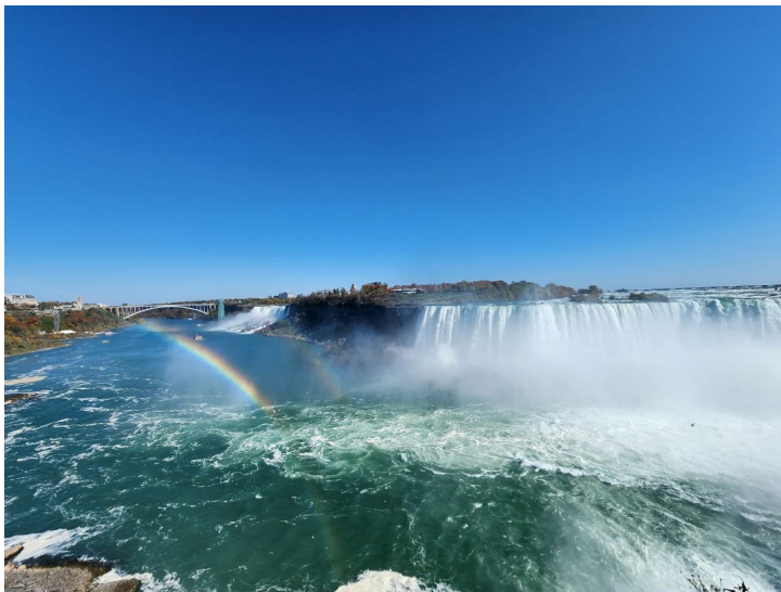
Figure 2 - Niagara Falls in September (Day)