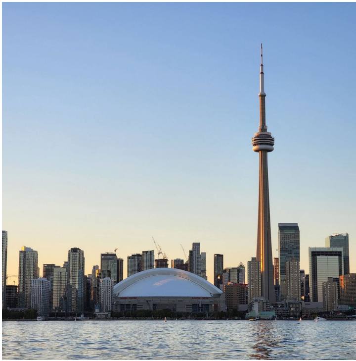
Figure 6 - Self Toronto exploration before start of Semester