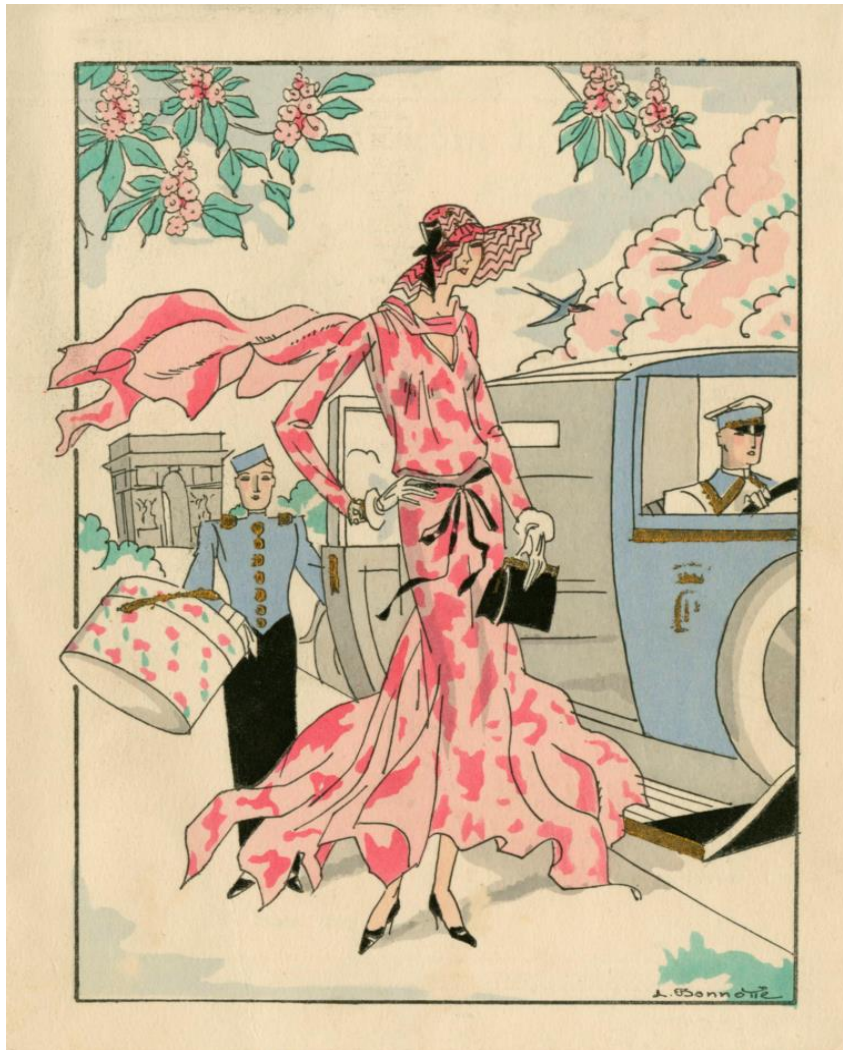
Invitation to an 'advance private showing of the modes for Spring and Summer 1930-31...' 1930-1931. D.I.C. New Zealand Limited: Ephemera, Eph-0015-HF-A-01. Hocken Ephemera collection.