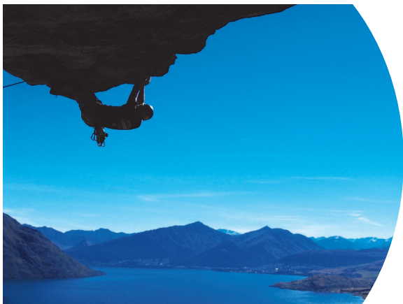
2005 Rock Climbing prac in Wanaka; let us know if this fearless soul is you!