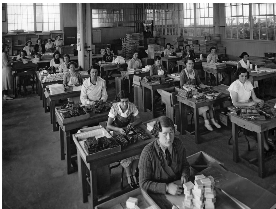
Women wrapping soap at the McLeod Brothers factory, Dunedin [1937] 89-083/002