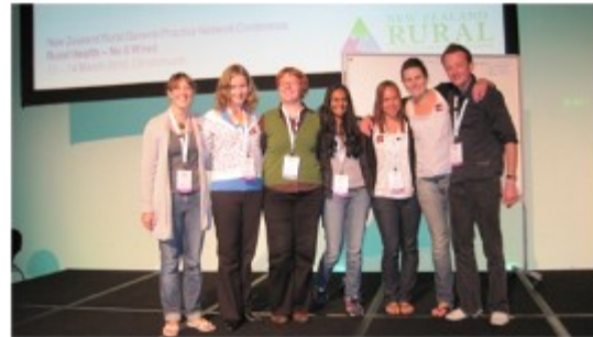
NZ Rural GP network conference