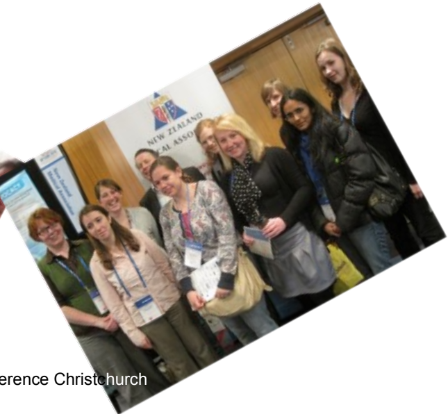
NZMA GPCME conference Christchurch