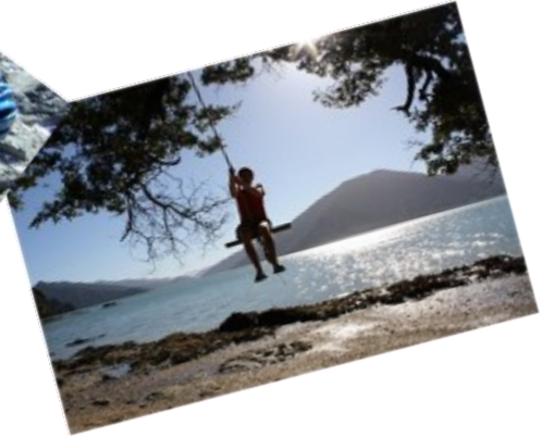
The vineyards and beaches of Marlborough and the Remarkables in Queenstown

The year ended with a party hosted by the students of Marlborough in their fabulous beachside residence.