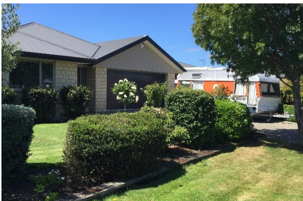
Catching covenants // Devon Allen