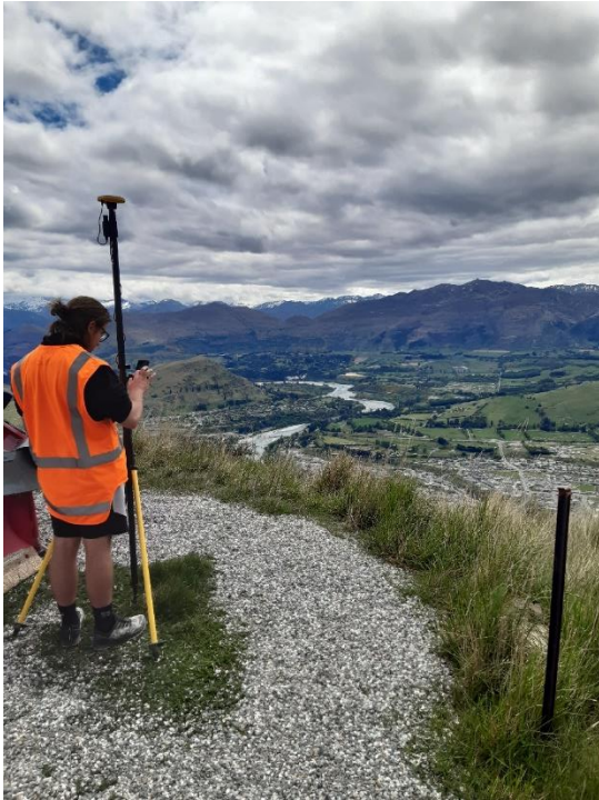
The Matariki Project: Easy, accessible, and automatic 3D-change detection with photogrammetry // Hugh Collins