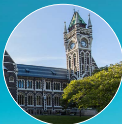
University of Otago

5 minutes' walk. New Zealand's only covered sports arena.