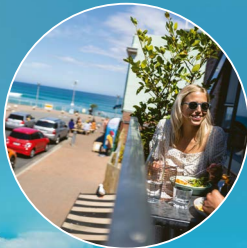
St Clair Esplanade 10 minutes' drive. Great surf spot with cafés and restaurants.

NO OTHER CITY in the country offers the same opportunities to get out and explore. Dunedin is surrounded by fantastic beaches, hills and harbour waters that offer opportunities for a range of activities, from surfing and kayaking to mountain biking and paddleboarding, most within a 10 minute commute.