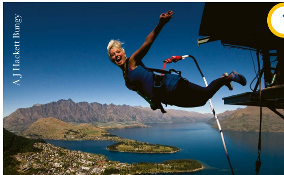
A J Hackett Bungee