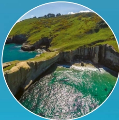
Tunnel Beach 20 minutes' drive. Spectacular rocky coastline with cliffs, rock arches and caves.