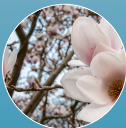
Dunedin Botanic Garden

Dunedin's main thoroughfare, with shops, cafés and restaurants.