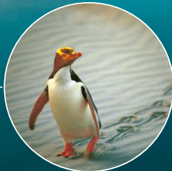
Otago Peninsula A wonderland of wildlife and scenery. At its end, Taiaaroa Head (1 hour's drive) has the only mainland breeding colony of northern royal albatross in the world.