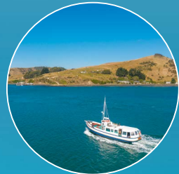
Otago Harbour 5 minutes' drive. Enjoy stunning views, nature cruises and a range of water sports, e.g. kayaking, rowing and windsurfing.