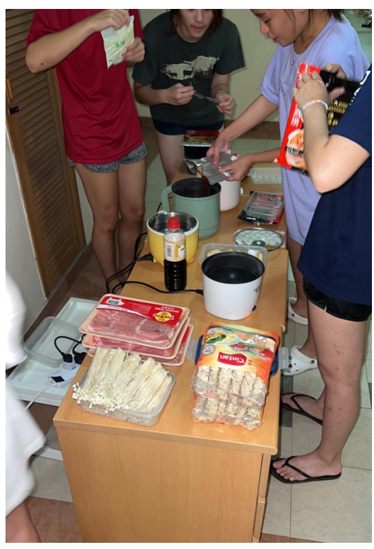
From NUS ^