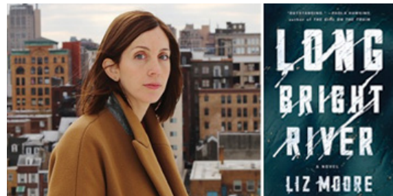
Alumni book club