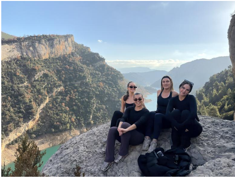
Congost de Mont-rebei (about a 3 hour drive inland from Barcelona – we hired a car – so worth it!)