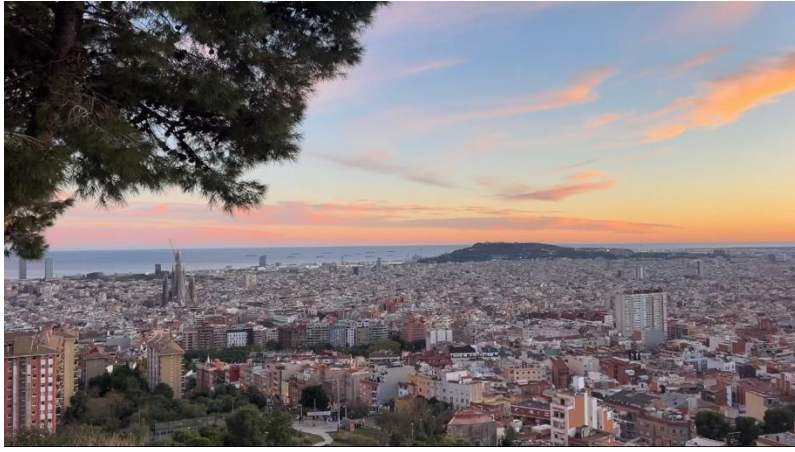
View from Pont de Mulberg