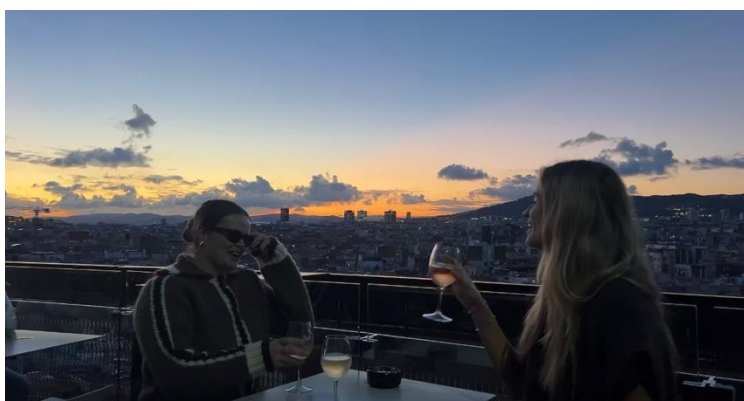
Terrassa 360 rooftop bar