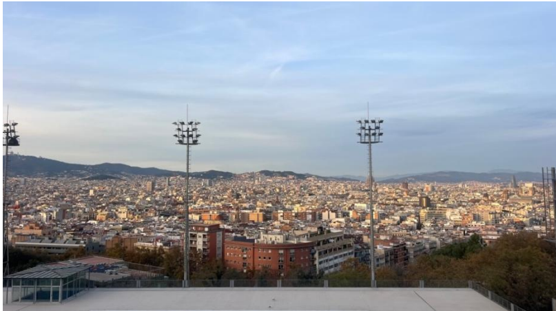
View from Salts Bar