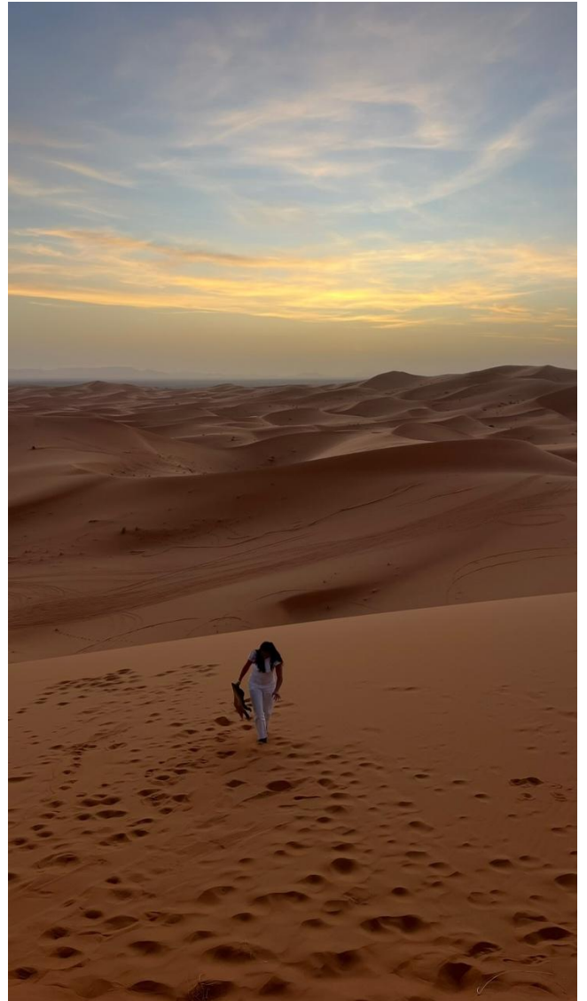
The Moroccan Sahara Desert