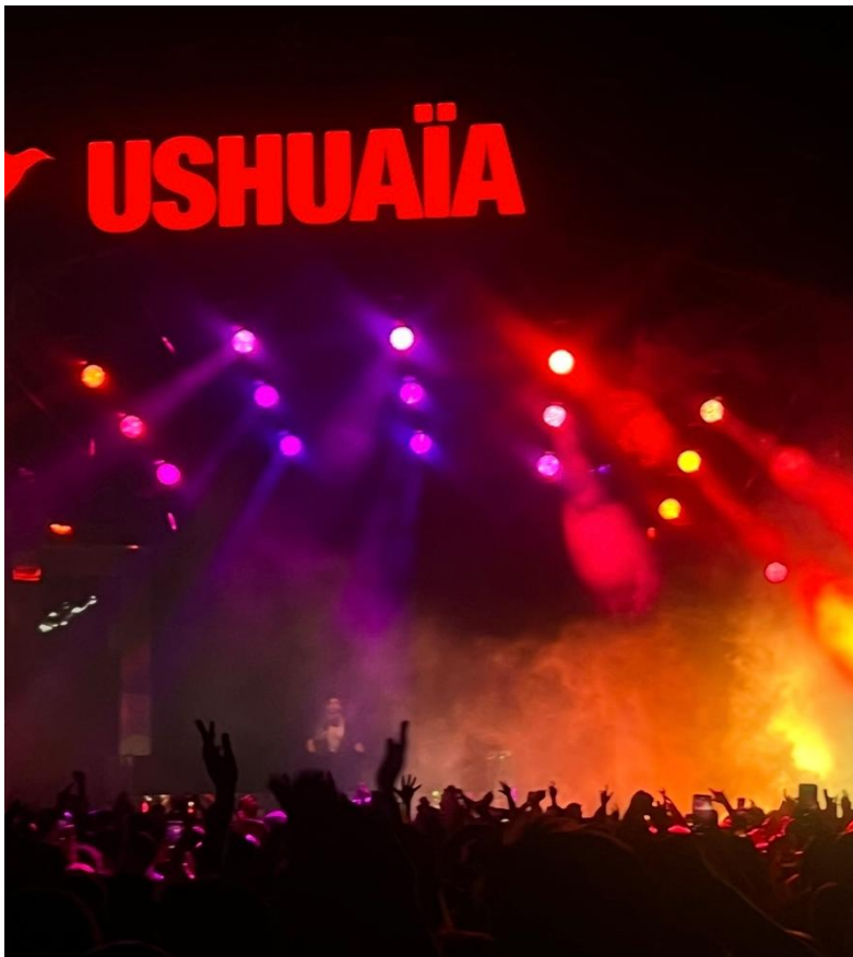
Calvin Harris in Ibiza