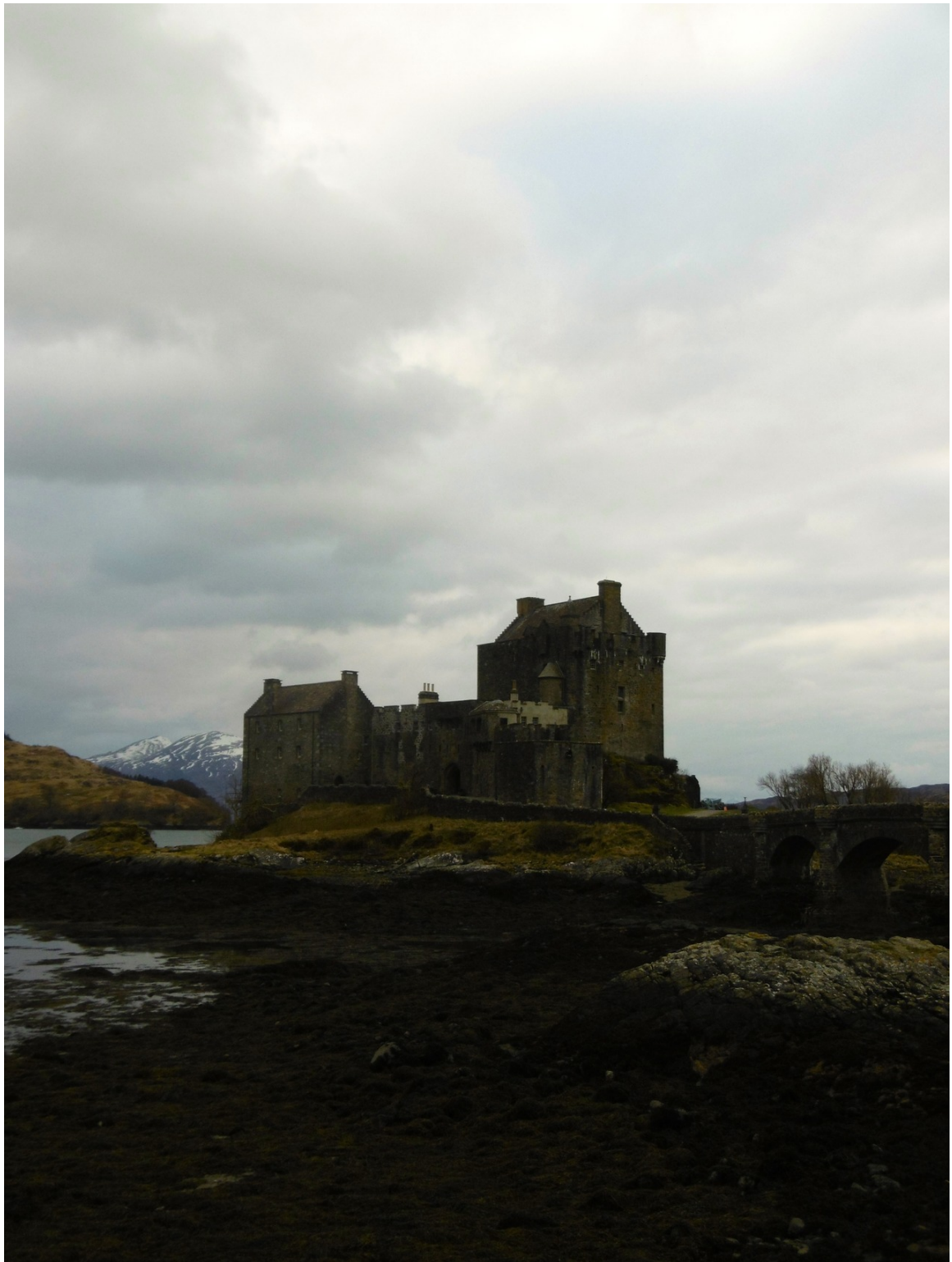
Eilean Donan Castle