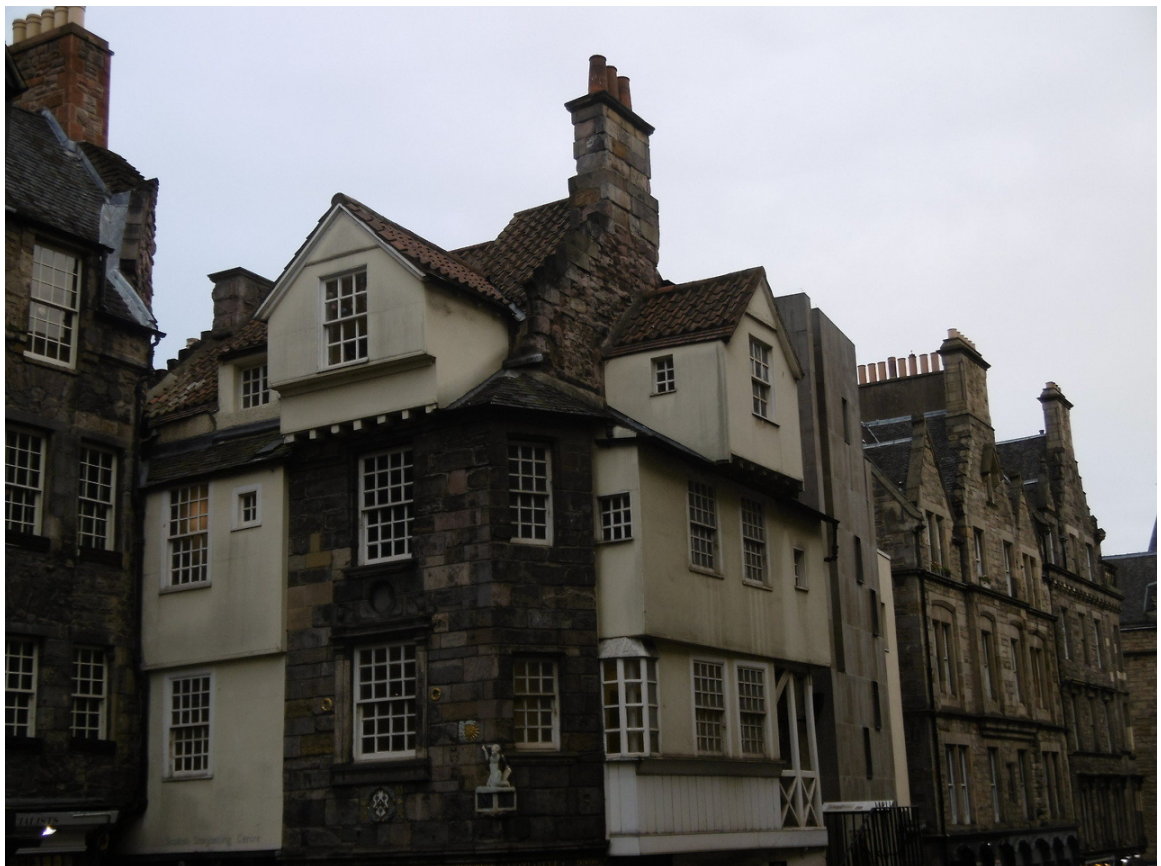
Medieval house, Edinburgh