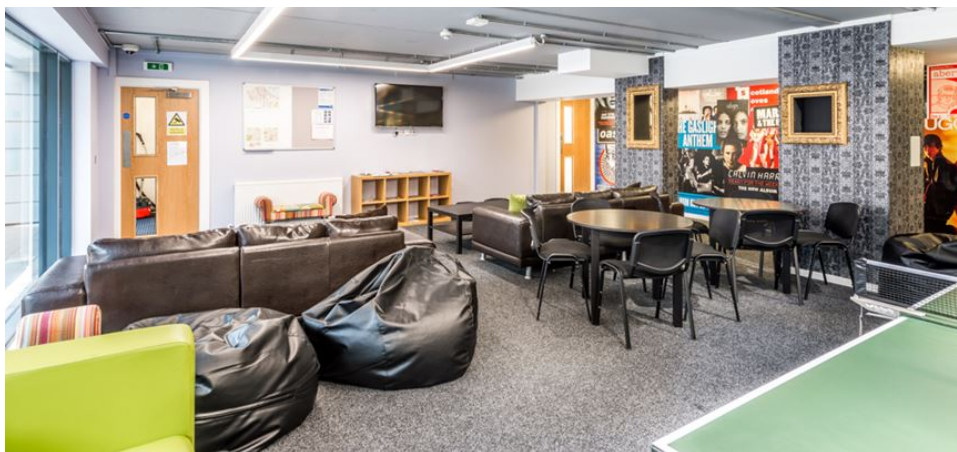
(Not my photos – they're from the accommodation website to give a rough idea of Murano).