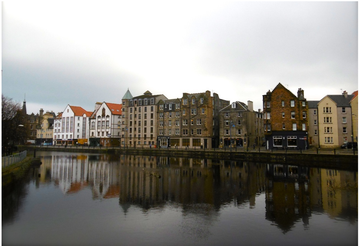
The Shore, Leith, Edinburgh