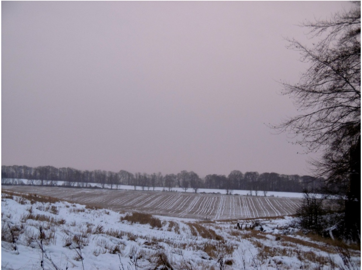
Snow at sunset in Fife (area just to the north of the city of Edinburgh)