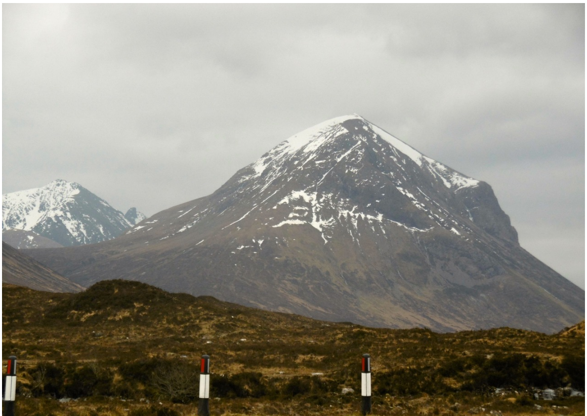
Isle of Skye