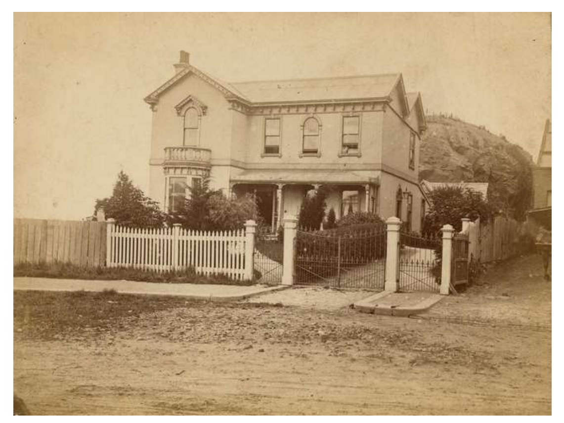
Dr Hocken's residence, Moray Place (nd). Photographs Collection Box-162-001.

Printed guides are freely available in the Hocken or can be downloaded online at <a href="https://www.otago.ac.nz/library/hocken/guides-to-the-hocken-collections">https://www.otago.ac.nz/library/hocken/guides-to-the-hocken-collections</a>