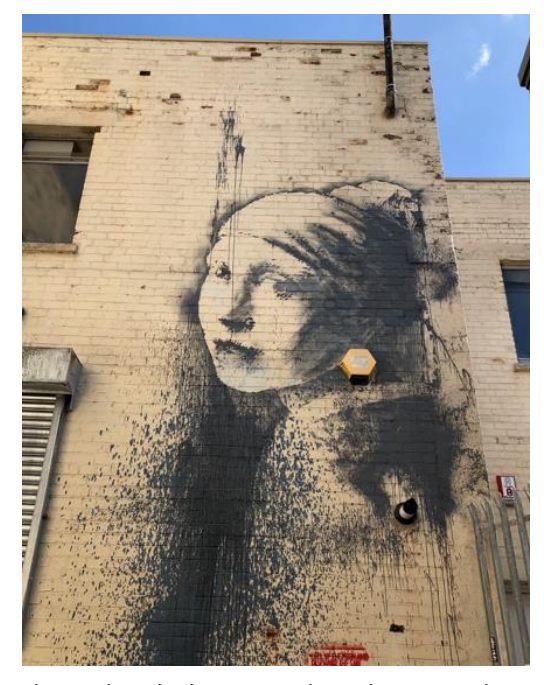
The Girl with the Pierced Eardrum, Banksy