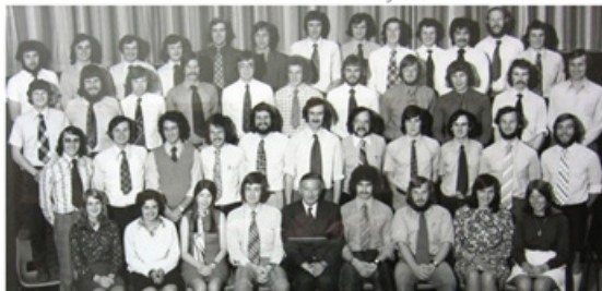
Christchurch Clinical School Class of 1974