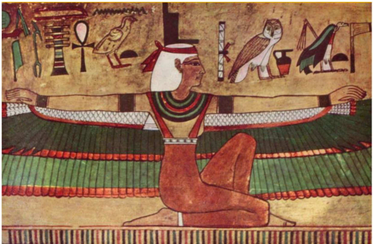
Isis wall painting in the tomb of Seti I (KV17), reigned ca. 1294–1279 BC