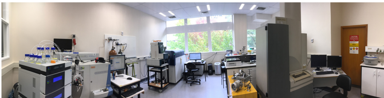
Centre for Protein Research new laboratory space.