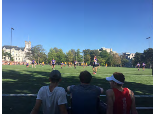
Queen's rugby game