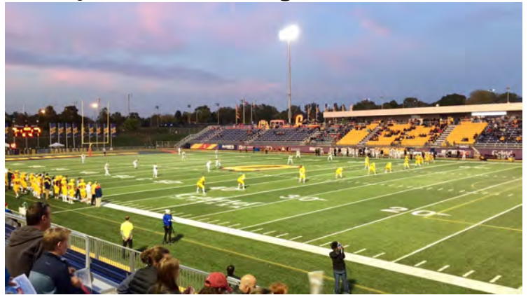
Queen's football game