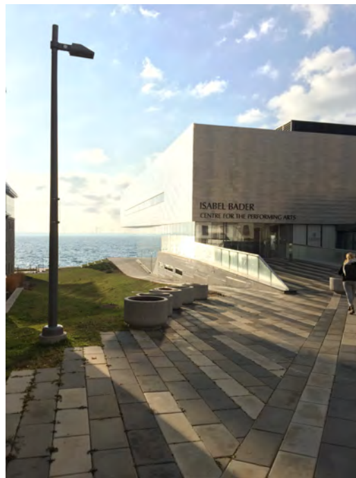
Isabel Bader Performing Arts Center (5 min off campus, where I took my courses)