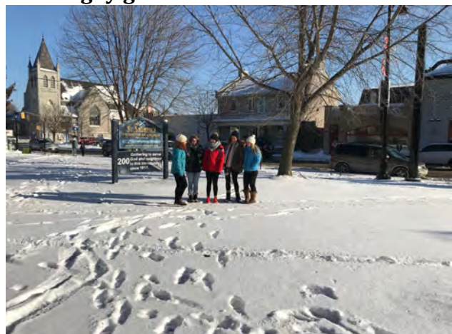
Downtown Kingston, end of December