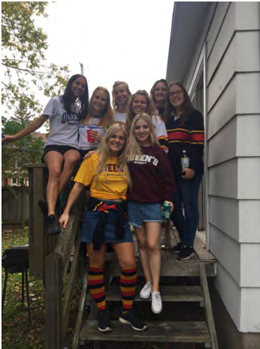
Queens 'Homecoming' weekend