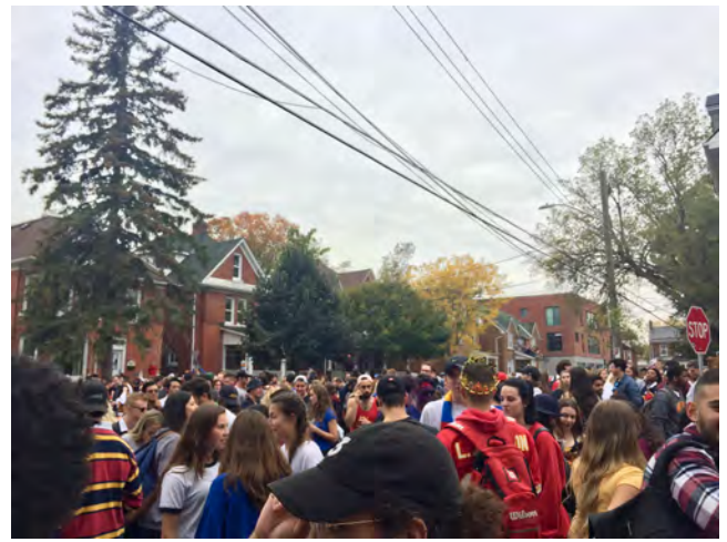
Queens 'Homecoming' weekend