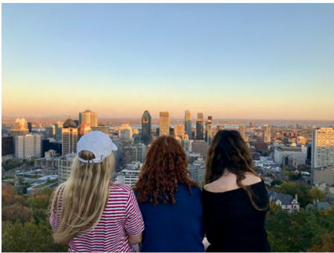
Mount Royal lookout in Montreal, Quebec