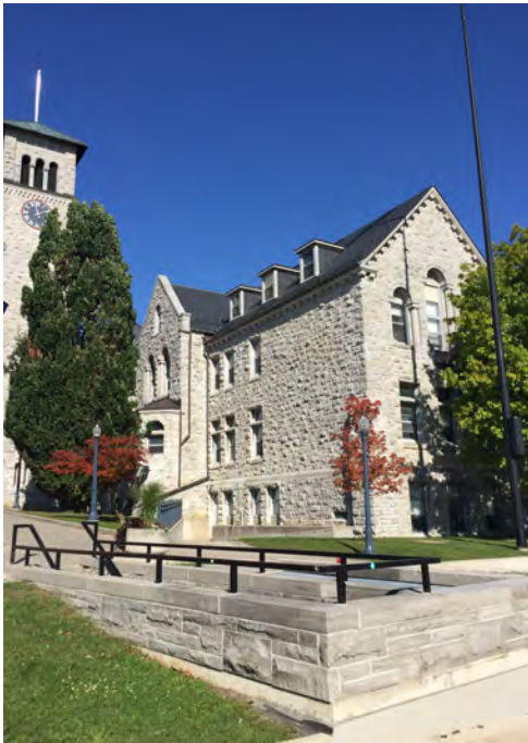
Queens campus in September (end of summer)

sport). But more importantly, I learnt a lot about myself. I realised that I could be independent in another country without my close kiwi friends or family. I realised that I could cope being on my own at the age of 19 in another country, which to me was a huge accomplishment. I thought to myself, if I can do that now, then I can do that anytime. Going on exchange has been a unreal experience and I will hold those memories from my time in Canada for the rest of my life. One of the most beneficial aspects of going on exchange is making international friends. I was blown away to meet people from countries I hadn't even heard of. My exchange has essentially allowed me to have international contacts all over the world, which I think is extremely cool. By having these friends, this will open up doors to places and people I would never of had if I didn't go on exchange. There are so many benefits to be gained from studying abroad, and I think there holds a lot of truth in the statement that "you never hear of anyone who had a bad exchange". Robert Herrick wrote a poem that talks about making the most of your opportunities... "Gather ye rosebuds while ye may, old time is still a flying and this flower that smiles today tomorrow will be dying". Therefore don't wait for this amazing exchange opportunity to pass you by because next thing you know you will be out of university, out in the workforce or at an age where you cannot manage it. Take the chance you wont regret it.