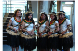
These beautiful Kiribati performers welcomed and open the conference with some Kiribati dancing.