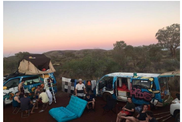
Karijini National Park

Cost: Perth is not a cheap city so be prepared to spend a little extra than what you would in Dunedin. However, in saying this, if you go flatting instead of a hall and take advantage of the $1 bus fares then you may end up saving money! There are a bunch of part time jobs going in Perth, and getting a job in the city is fine because it only takes 15minutes on the bus! I got one at the Uni Café working for $22 an hour by looking at the Uni Careers page, but you can also try Seek and good old CV drop ins at all the cafes around the Crawley area, especially Hampden road where heaps of students got jobs! Pay is so much better in Australia than NZ!