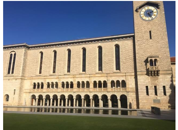
Winthrop Hall, UWA Campus

the extra money to go into a hall of residence. Like Dunedin, there are many hall options within a 5-10 minute walk of campus so you can't go wrong with location. I found that Trinity College (second cheapest) was the best fit for me; it had a 50/50 split of International students to Australian students which meant you could make friends in both groups, as opposed to Unihall (cheapest hall) which was 90% international students who seemed to keep to themselves. If you are older like me (20/21) then don't be put off going into a hall by the Otago experience, in Australia students generally tend to go into halls for their entire studies rather than just fresher year, and \frac{3}{4} of the students are second and third year! I don't think I spoke to a single fresher the entire time I was there as they are kept in a separate wing.