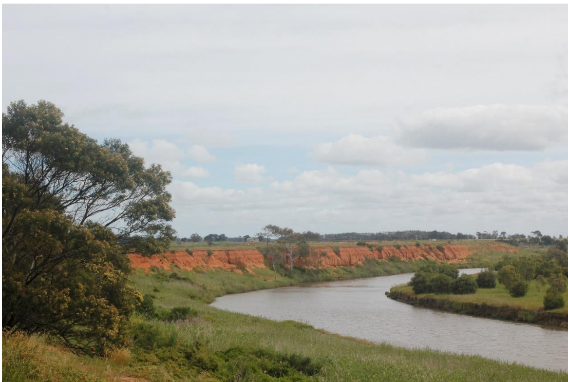
Red cliffs lookout (Werribee)