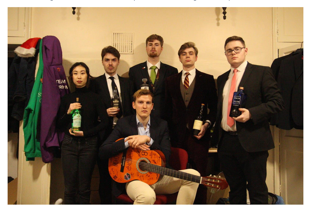
Figure 5 The people were the best thing I experienced during exchange, many lifelong friends were made and even a brother, this photo was taken at one of our underground whiskey society meetings with the committee members