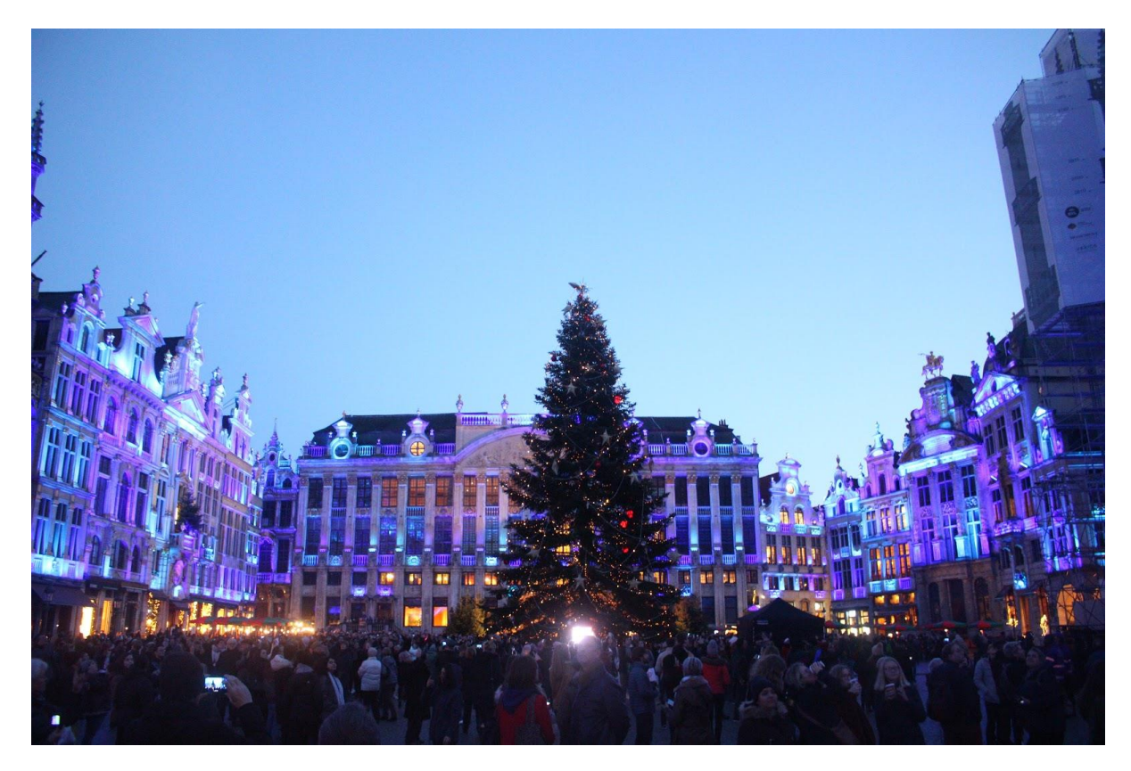
Figure 1 My first Christmas away from home and without family spent in Belgium, this photo taken in Le Grand Place in the centre of Brussels

Without a doubt one of the best decisions I have made in my life so far. The learning experiences I got and the field experts I met will allow for me to continue to benefit from my experience long after I have actually left. While my original intentions were driven solely by my academics coming out the other side it was everything else that makes me want to go back. The people the atmosphere and the places were amazing. I met people from across the globe and the only bad thing about it was having to say goodbye at the end. I participated in rowing and frisbee, made it to a lacrosse final in my first year and made it on to the university rifle team as an amateur. I learned from the people and the people learned from me. The places I went blew me away from Durham itself the beautiful cathedral city to the shores of the Mediterranean in Spain and the Forum of ancient Rome. This was a one of a kind experience that I cannot stress enough has changed my life for the better, forever.