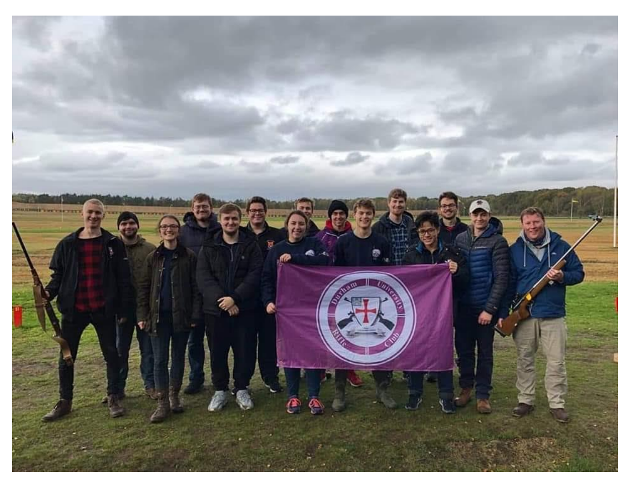
Figure 4 Getting involved in sports was something I cherished most on this exchange and this photo was taken during a full bore rifle shooting event with the Durham University rifle team which I managed to earn a spot on