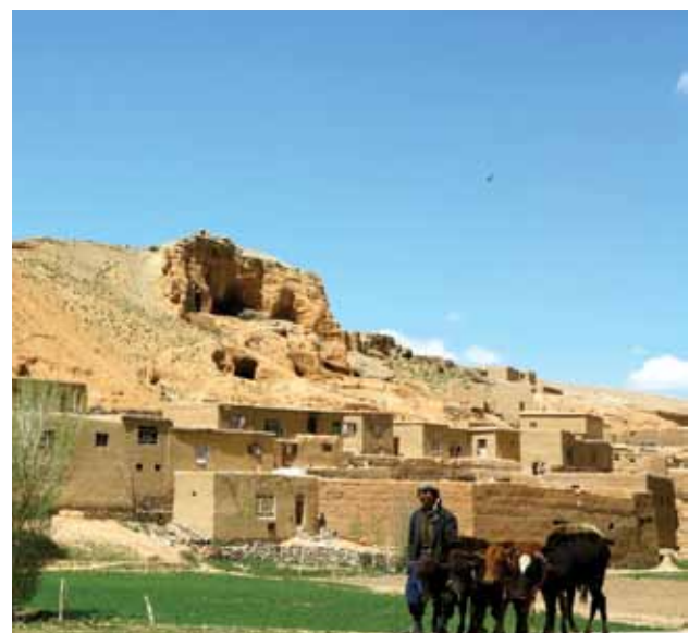
Local Kahmard District village with farmer moving cattle.