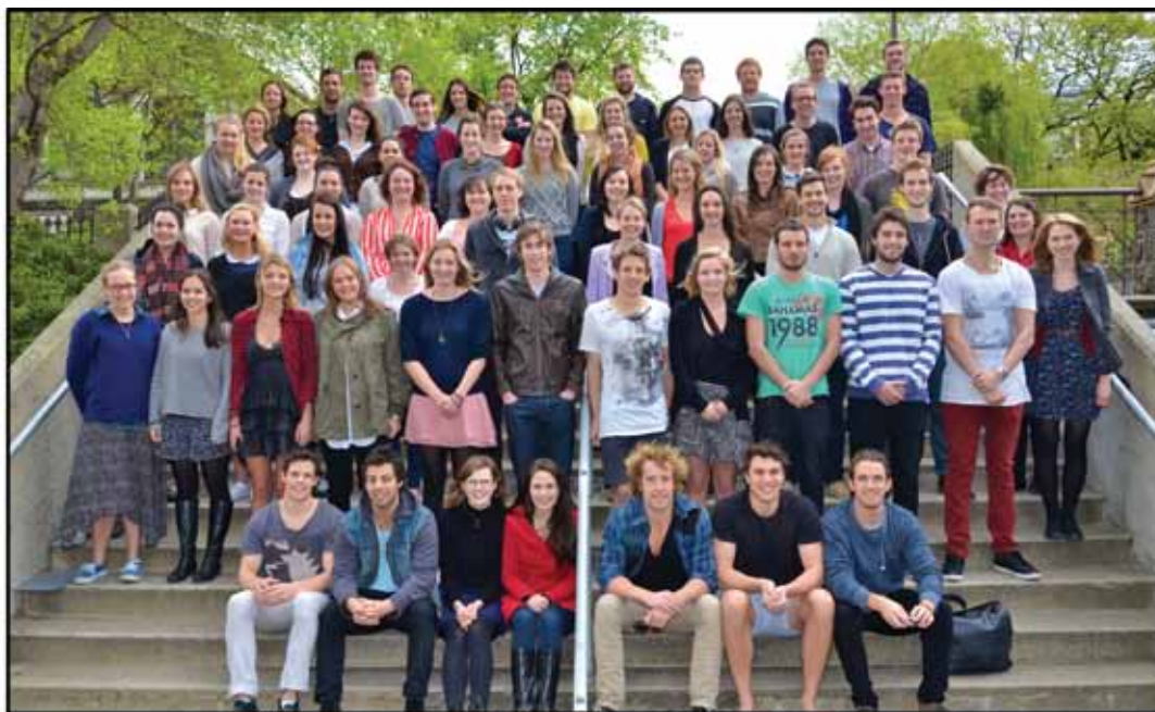
Faculty of Law, University of Otago Final year LLB and LLB (Honours) Students 2012