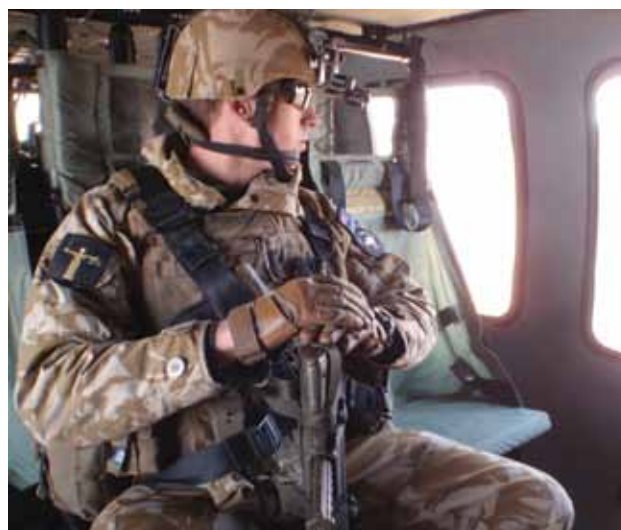
Travelling by US Blackhawk helicopter to border to visit Afghan community leaders.

During my twelve-month deployment, I was primarily based out of Combat Outpost Romero (COP Romero) in the Kahmard District, but I also worked at Kiwi Base in Bamian town and Forward Patrol Base Malone-Durrer in Do Abe. Bamyan Province is a very challenging environment in which to work; incredibly cold in winter; blisteringly hot in summer and prone to torrential rains which wash away the roads and snows that isolate the remote areas (including COP Romero). The environmental challenges were exasperated by the cultural challenges of working with a xenophobic and highly mistrusting people. The Afghans have suffered from a lack of a functioning cohesive society for over quarter of a century. The constant warring, political upheaval and crippling poverty have all but destroyed any form of infrastructure and left the people wary of outsiders. The flexible understanding of concepts such as truth, loyalty and morality created a very difficult cultural miasma to come to terms with.