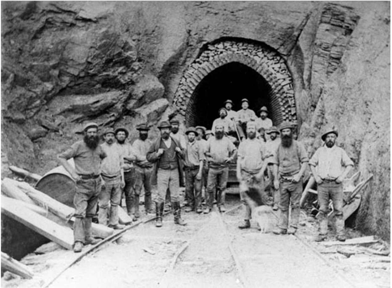
Duck Point Tunnel on the Otago Central Railway. F.A. Coxhead photograph. Photographs Collection. S08-167.

Hocken Collections/Te Uare Taoka o Hākena 90 Anzac Ave, PO Box 56, Dunedin 9054 Phone 03 479 8868 reference.hocken@otago.ac.nz https://www.otago.ac.nz/library/hocken/