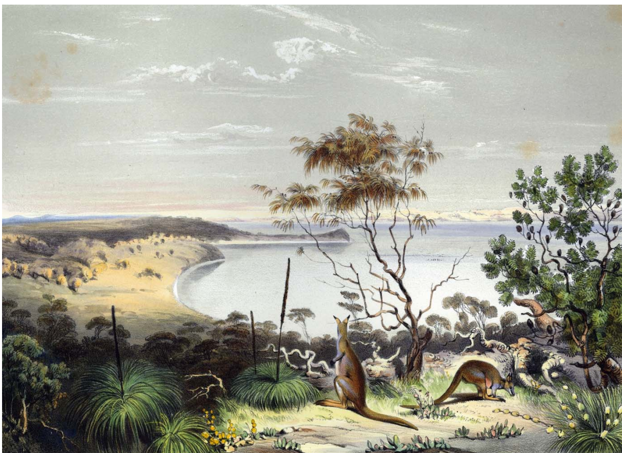
'Scene on the Coorong, near Lake Albert. With the Halmaturus Greyii , a new species of kangaroo.' South Australia Illustrated by George French Angas, London: Thomas McLean, 1847. Publications Collection, s15-546b.