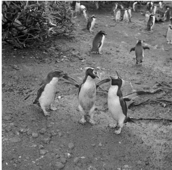
Penguins on the Snares Islands, MS-1260-039/001, Lance Richdale papers, Archives Collection, S11-098a.