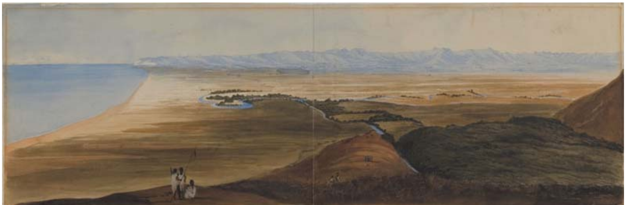
Sir William Fox. The Wairau Plain (1845). Watercolour on 2 sheets of paper, each: 361 x 722mm; joined to form: 220 x 722mm. Accession no.: 12,900.