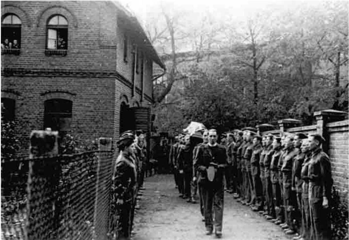
Prisoner of War Camp Stalag VIII B, Germany, 1942-3, from photographs collected by Sgt. Clin Thomas Power. Photographs Collection. Reader access file / P97-122.

Hocken Collections/Te Uare Taoka o Hākena 90 Anzac Ave, PO Box 56, Dunedin 9054 Phone 03 479 8868 reference.hocken@otago.ac.nz http://www.otago.ac.nz/library/hocken/