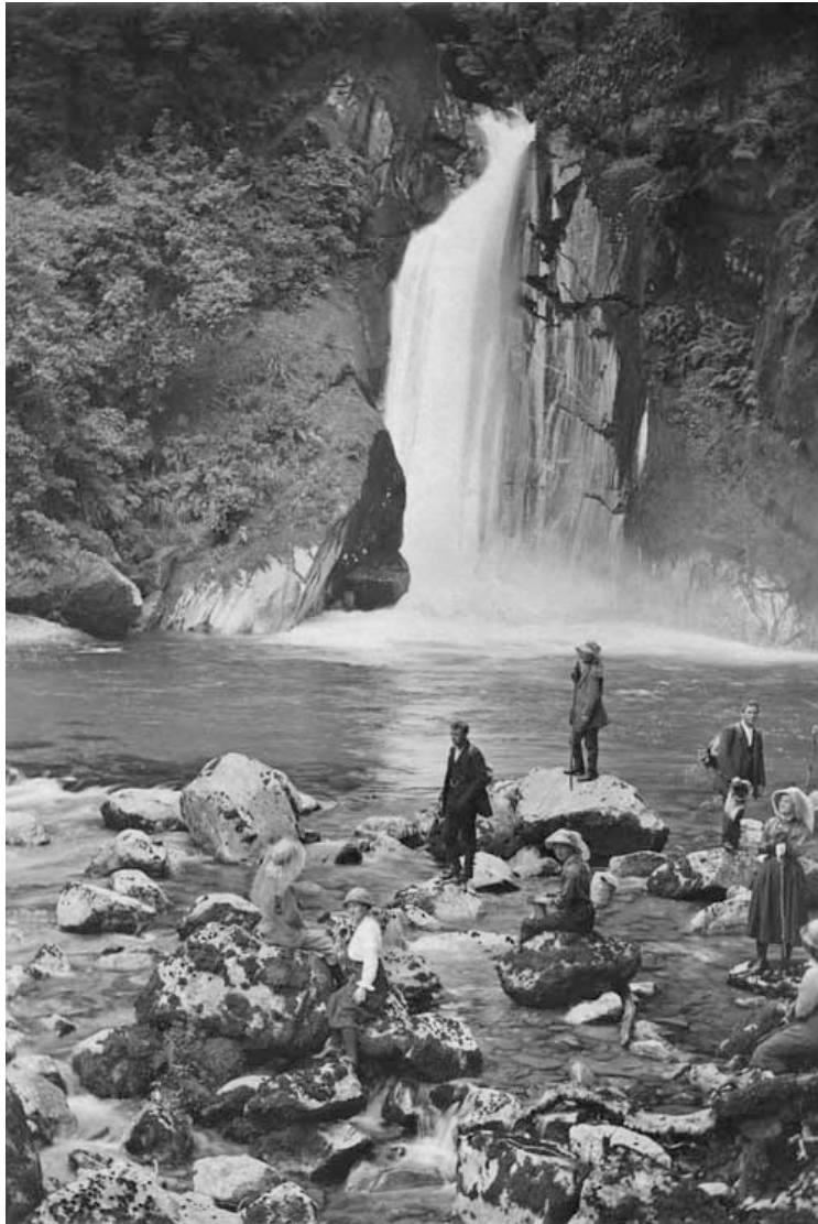
The Giants Gate Lake Ada, photographer unknown, gelatin silver print, Hocken Photographs, K.L. McKay collection, S09-305d.

Hocken Collections/Te Uare Taoka o Hākena 90 Anzac Ave, PO Box 56, Dunedin 9054 Phone 03 479 8868 reference.hocken@otago.ac.nz http://www.otago.ac.nz/library/hocken/