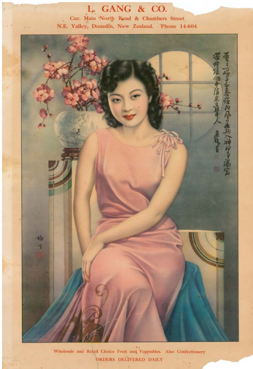
L. Gang & Co. poster. Hocken Posters Collection.

Hocken Collections/Uare Taoka o Hākena 90 Anzac Ave, PO Box 56, Dunedin 9054 Phone 03 479 8868 reference.hocken@otago.ac.nz https://www.otago.ac.nz/library/hocken/