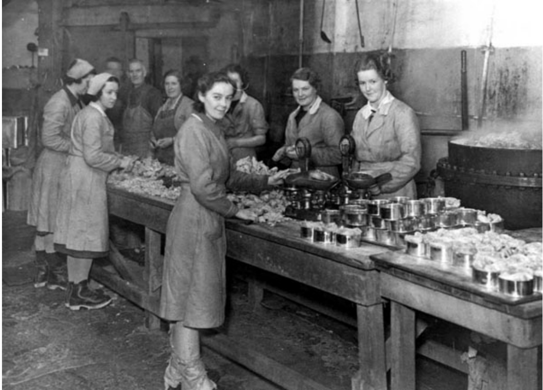
Packing sheep's tongues at Irvine and Stevenson St George Co. Ltd, 1942. S06-194b, Pictorial Collections.

Hocken Collections/Te Uare Taoka o Hākena 90 Anzac Ave, PO Box 56, Dunedin 9054 Phone 03 479 8868 reference.hocken@otago.ac.nz https://www.otago.ac.nz/library/hocken/