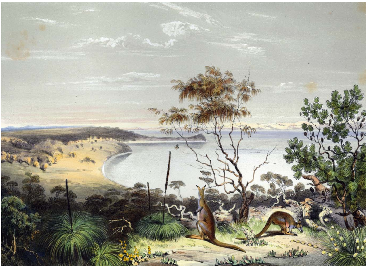
'Scene on the Coorong, near Lake Albert. With the Halmaturus Greyii, a new species of kangaroo.' South Australia Illustrated by George French Angas, London: Thomas McLean, 1847.