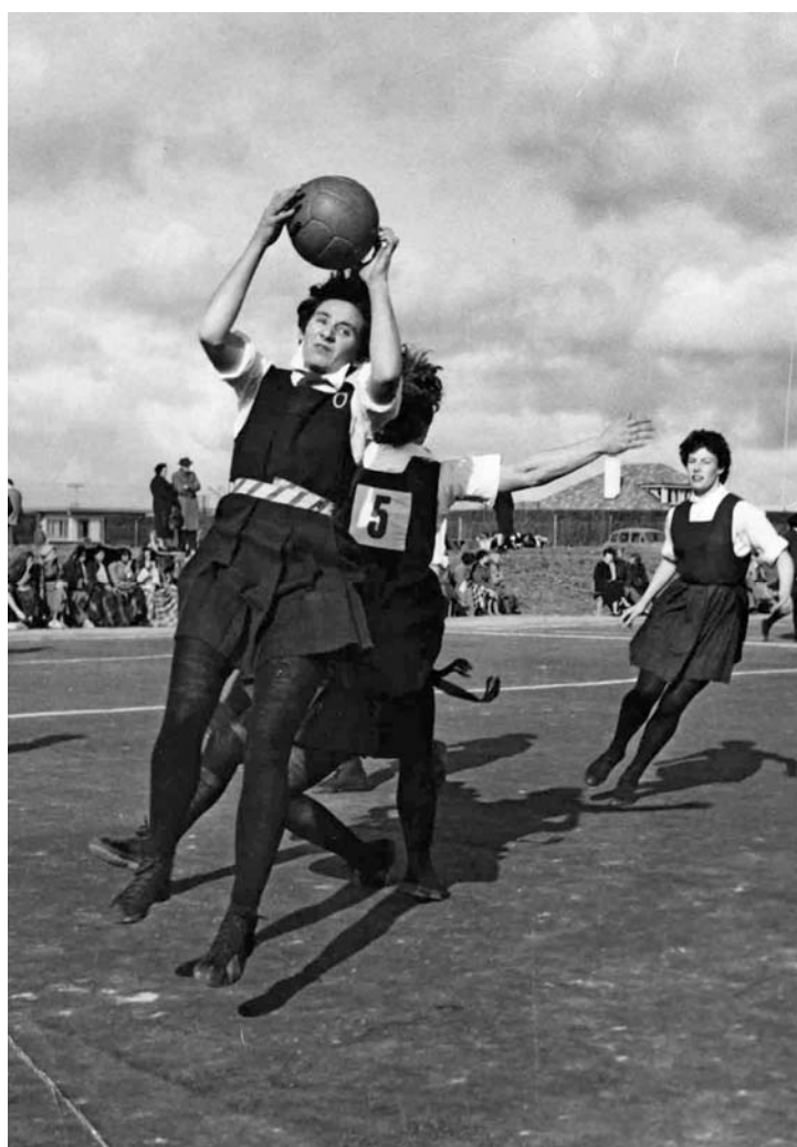
Netball game, 1953. Netball Otago records, MS-3416/184, S11-509a, Archives Collection.