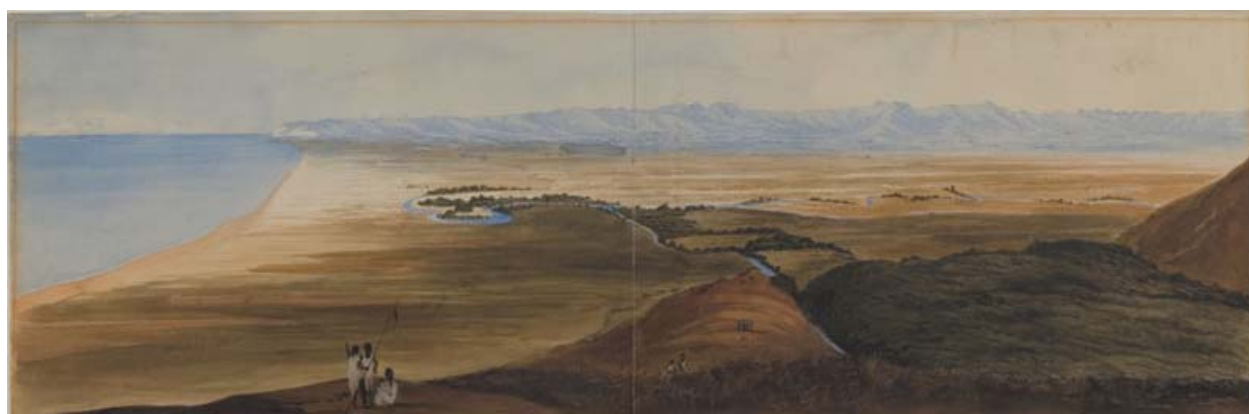
Sir William Fox. The Wairau Plain (1845). Watercolour on 2 sheets of paper, each: 361 x 722mm; joined to form: 220 x 722mm. Accession no.: 12,900.