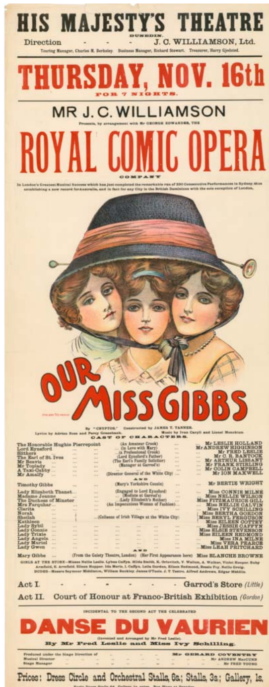
Our Miss Gibbs. [1911]. S14-536e, Posters Collection.

Hocken Collections/Te Uare Taoka o Hākena 90 Anzac Ave, PO Box 56, Dunedin 9054 Phone 03 479 8868 reference.hocken@otago.ac.nz https://www.otago.ac.nz/library/hocken/