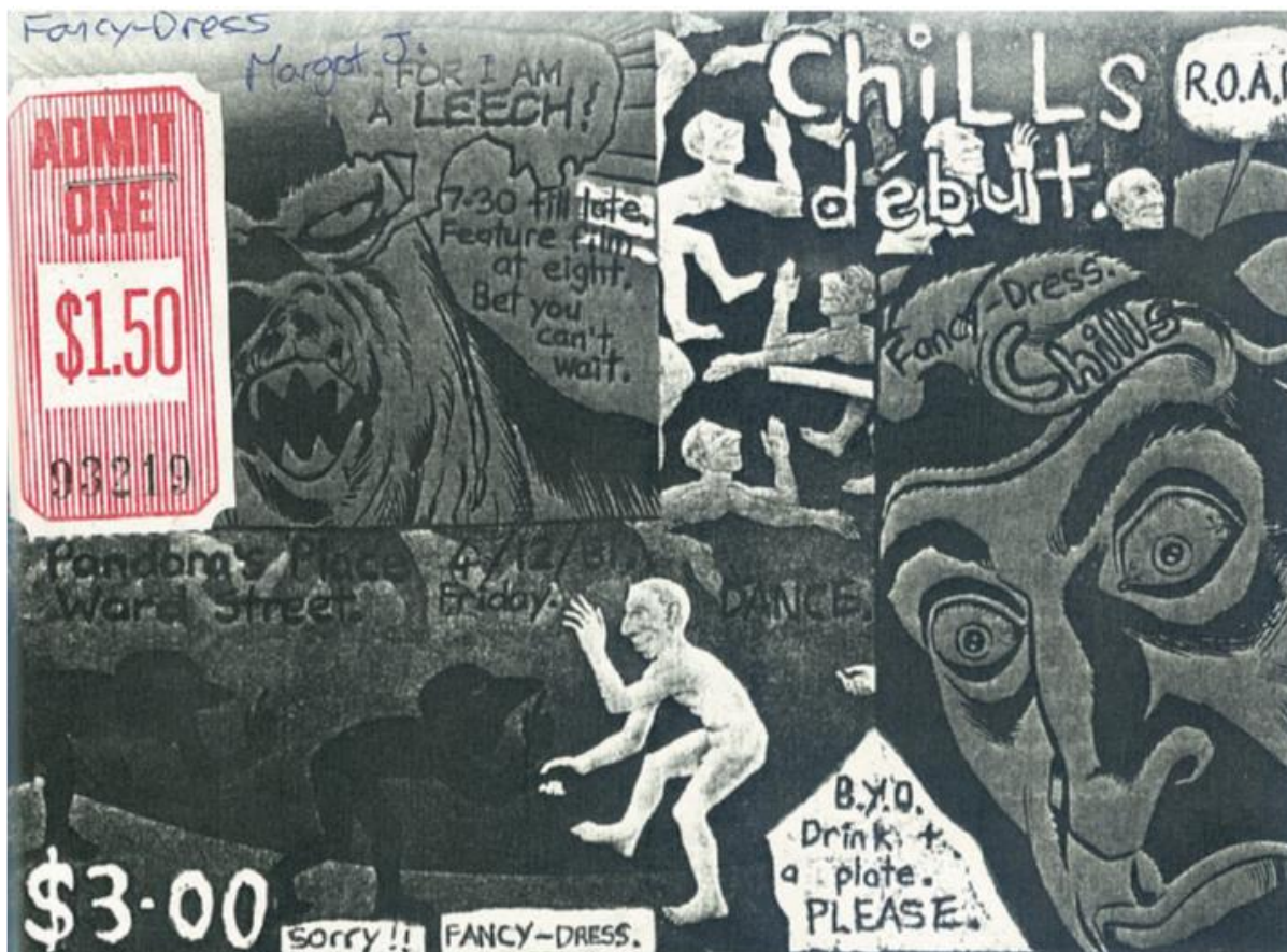
'Chills debut' concert ticket. c.1981. Hocken Ephemera Collection [uncatalogued]. Permission to use image kindly granted by Martin Phillipps.

Hocken Collections/Te Uare Taoka o Hākena 90 Anzac Ave, PO Box 56, Dunedin 9054 Phone 03 479 8868