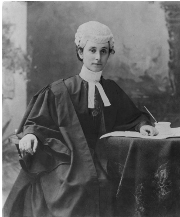
Ethel Benjamin (1875-1943), University of Otago graduate and the first woman in the British Empire to qualify as a barrister and solicitor.