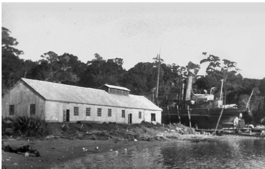
Rosshavet Whaling Company's Kaipipi Shipyards (Album 54)