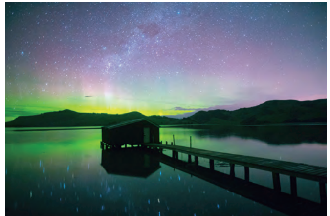
Fig. 2: Aurora seen from Hoopers Inlet, a 30min drive from the centre of Dunedin.