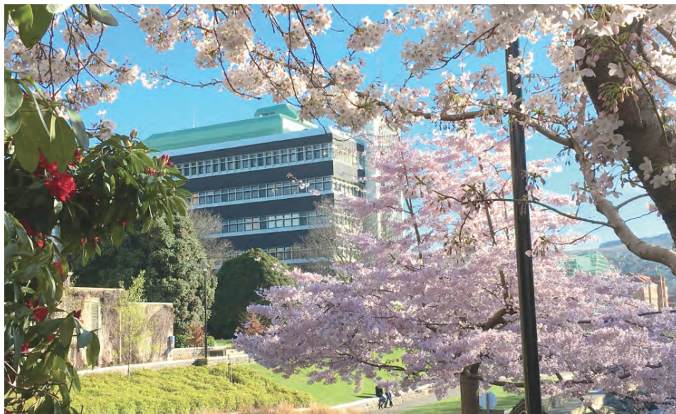
Fig. 1: The Science III building is home to the Physics Department. This photo, taken in September, shows the spring blossom. Visible at the lower right corner is the Leith River that runs through the campus.

CRAIG J. RODGER AND P. BLAIR BLAKIE DEPARTMENT OF PHYSICS, UNIVERSITY OF OTAGO, NEW ZEALAND