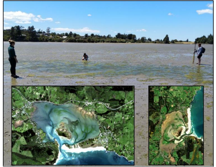
Quantifying Ulva cover in Otago Coastal Estuaries with Satellite Remote Sensing // Xuhong Chai and Laura Sterup