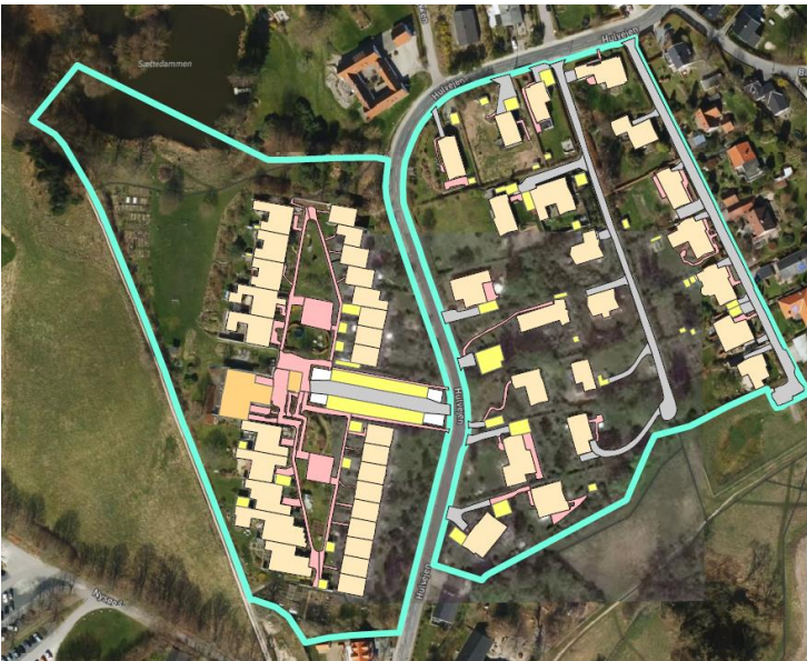
Comparative spatial analysis of cohousing and conventional housing developments // Khaylm Marshall