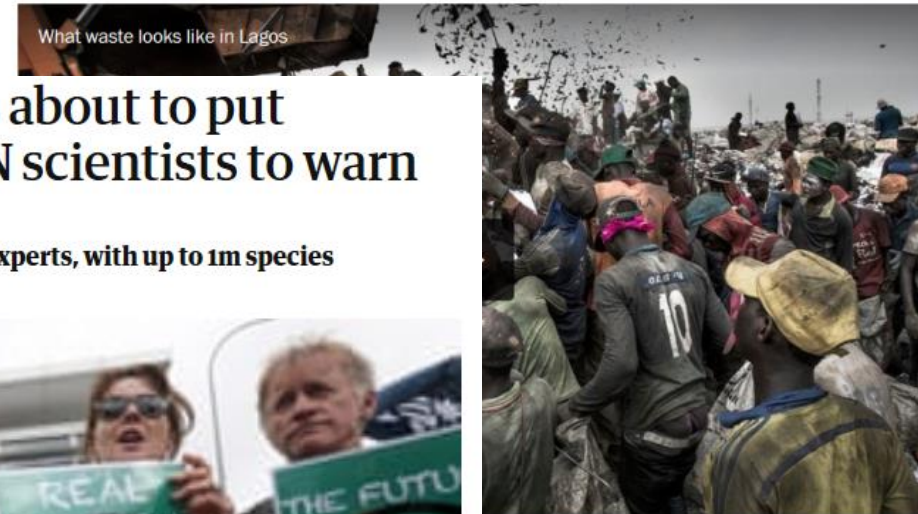
Typical scene at the waste dumps in Lagos, Nigeria.